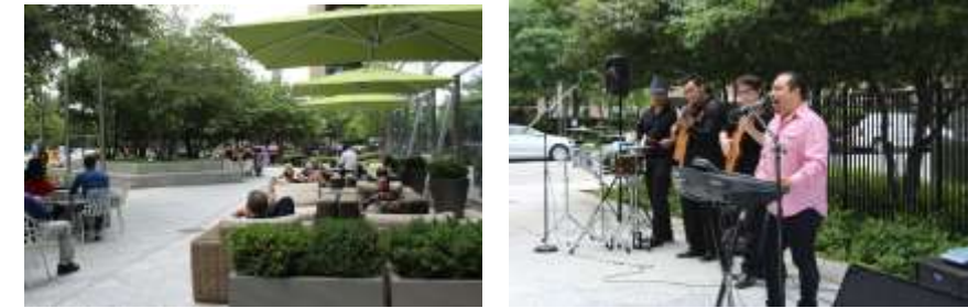
(Gypsy Kings on July 14 th )

Join us on Friday, August 4 th : Americana, Country & Swing & Friday, August 25 th : Salsa Band 12:00 PM – 1:30 PM