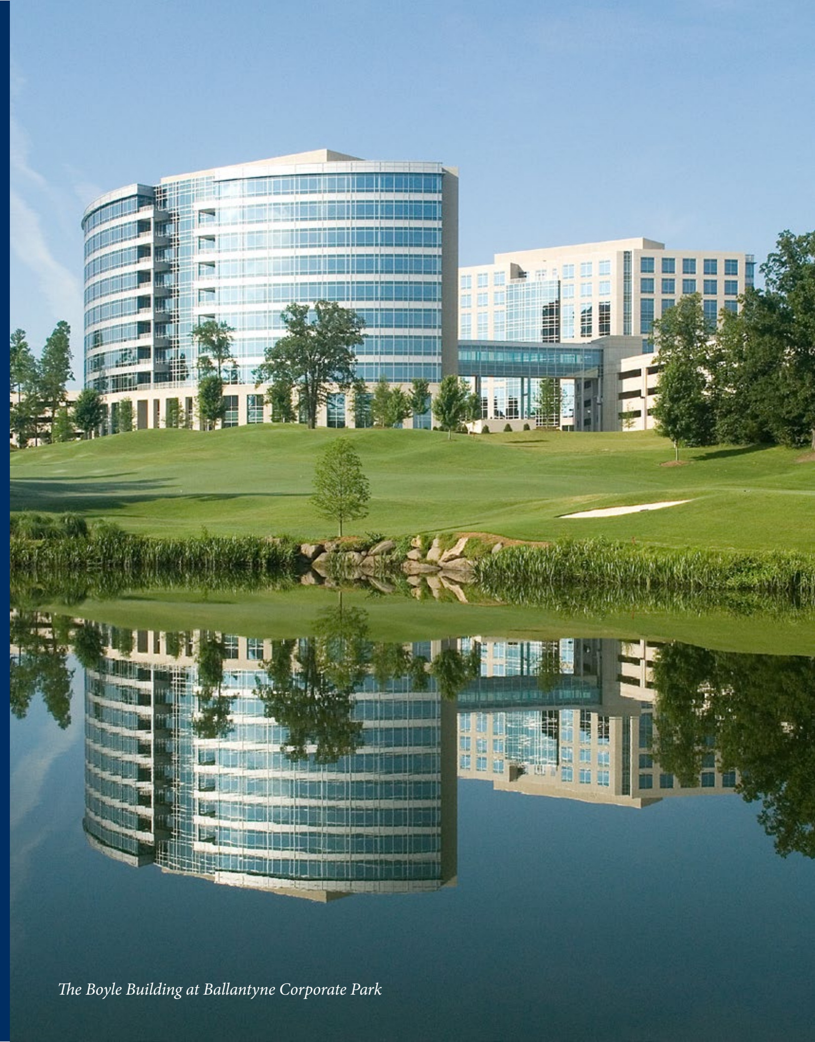
The Boyle Building at Ballantyne Corporate Park